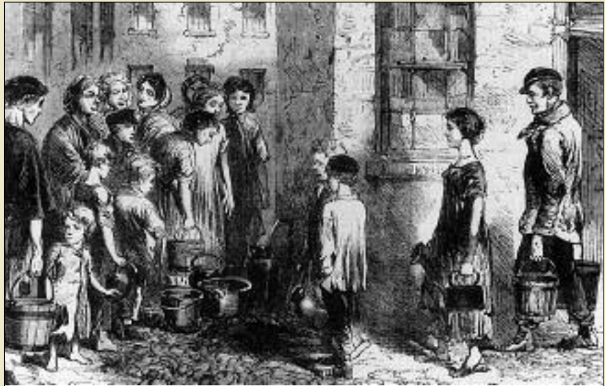
Haunt for cholera in The Penny Illustrated Newspaper October 1865 Two little girls with their water jugs can be seen walking along the road in Work

The face of Britain was changing dramatically as people flocked from the countryside into the towns to find work. The nature of their work also changed; it was no longer dictated by daylight or the seasons but by bells and clocks. These 'first-born sons of modern industry' as Marx called English working men in his 1848 Communist Manifesto , were a visible and often threatening presence on the city streets and their plight became the subject of debate.